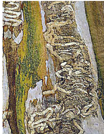
Figure 3. Galleries excavated by larvae.