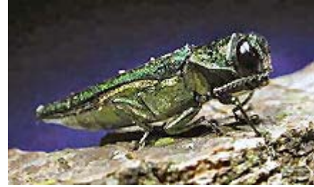
Figure 1. Adult emerald ash borer.

The emerald ash borer generally has a one-year life cycle in southern Michigan but could require two years to complete a generation in colder regions. In 2003, adult emergence began in early June, peaked in late June and early July, and continued into late July. Beetles usually live for about 3 weeks and are present into mid-August. Adult beetles are active during the day, particularly when conditions are warm and sunny. Most beetles remain in protected locations in bark crevices or on