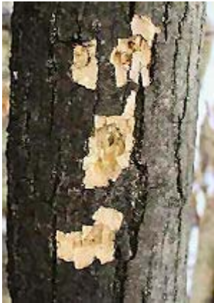
Figure 5. Jagged holes left by woodpeckers