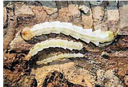
Figure 2. Second, third, and fourth stage larvae.