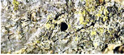
Figure 4. D-shaped exit holes where adult beetles emerged.