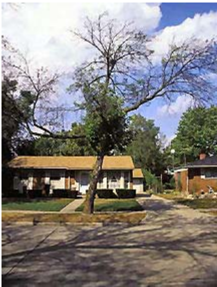
Figure 6. Much of the canopy is dead on a heavily infested ash tree.

The emerald ash borer is native to Asia and is known to occur in China, Korea, Japan, Mongolia, the Russian Far East and Taiwan. A Chinese report indicates high populations of the borer occur primarily in Fraxinus chinensis and F. rhynchophylla forests. Other reported hosts in Asia include F. mandshurica var. japonica , Ulmus davidiana var. japonica , Juglans mandshurica var. sieboldiana and Pterocarya rhoifolia . In North America, this borer has only attacked ash trees. Green ash ( F. pennsylvanica ), white ash ( F. americana ) and black ash ( F. nigra ), as well as several horticultural varieties of ash have been killed.