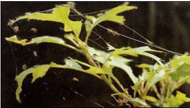
Figure 4 - Gypsy moth larvae suspended on silken threads.

Larvae are dispersed in two ways. Natural dispersal occurs when newly hatched larvae hanging from host trees on silken threads (fig. 4) are carried by the wind for a distance of about 1 mile. Larvae can be carried for longer distances. Artificial dispersal occurs when people transport gypsy moth eggs thousands of miles from infested areas on cars and recreational vehicles, firewood, household goods, and other personal possessions.