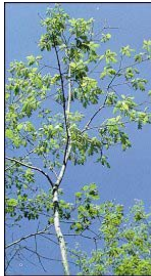
Figure 12 - Tree after refoliation.

Trees use energy reserves during refoliation and are eventually weakened. Weakened trees exhibit symptoms such as dying back of twigs and branches in the upper crown and sprouting of old buds on the trunk and larger branches. Weakened trees experience radial growth reduction of approximately 30 to 50 percent.