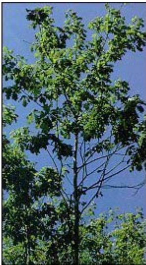
Figure 11 - Tree before defoliation.

If more than 50 percent of their crown is defoliated, most hardwoods will refoliate or produce a second flush of foliage by midsummer (figs. 11, 12). Healthy trees can usually withstand one or two consecutive defoliations of greater than 50 percent. Trees that have been weakened by previous defoliation or been subjected to other stresses such as drought are frequently killed after a single defoliation of more than 50 percent.