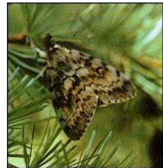
Figure 9 - Male gypsy moth.

The male gypsy moth emerges first, flying in rapid zigzag patterns searching for females. When heavy, egg-laden females emerge, they emit a chemical substance called a pheromone that attracts the males (fig. 9). The female lays her eggs in July and August close to the spot where she pupated (fig. 10). Then, both adult gypsy moths die.