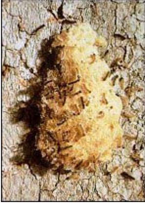
Figure 3 - Gypsy moth larvae emerging from egg mass.

Larvae are dispersed in two ways. Natural dispersal occurs when newly hatched larvae hanging from host trees on silken threads (fig. 4) are carried by the wind for a distance of about 1 mile. Larvae can be carried for longer distances. Artificial dispersal occurs when people transport gypsy moth eggs thousands of miles from infested areas on cars and recreational vehicles, firewood, household goods, and other personal possessions.