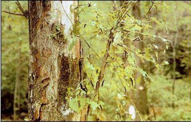
Figure 7 - A tree stripped by gypsy moth larvae

The larvae reach maturity between mid-June and early July. They enter the pupal stage (fig. 8). This is the stage during which larvae change into adults or moths. Pupation lasts from 7 to 14 days. When population numbers are sparse, pupation can take place under flaps of bark, in crevices, under branches, on the ground, and in other places where larvae rested. During periods when population numbers are dense, pupation is not restricted to locations where larvae rested. Pupation will take place in sheltered and non-sheltered locations, even exposed on the trunks of trees or on foliage of nonhost trees.