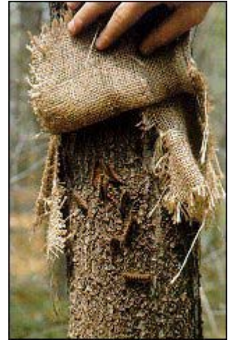
Figure 14 - Gypsy moth larvae and pupae under burlap