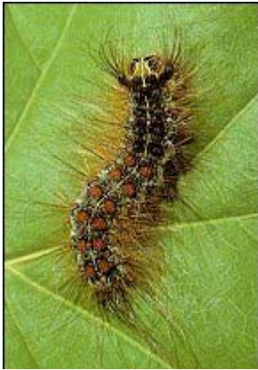
Figure 5 - Older Gypsy moth larvae showing five pairs of raised blue spots and six pairs of raised brick-red spots.

During the first three instars, larvae remain in the top branches or crowns of host trees. The first stage or instar chews small holes in the leaves (fig. 6). The second and third instars feed from the outer edge of the leaf toward the center.