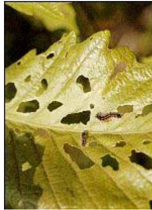
Figure 6 - First instar gypsy moth larvae chewing small holes in leaves.

When population numbers are sparse, the movement of the larvae up and down the tree coincides with light intensity. Larvae in the fourth instar feed in the top branches or crown at night. When the sun comes up, larvae crawl down the trunk of the tree to rest during daylight hours. Larvae hide under flaps of bark, in crevices, or under branches - any place that provides protection. When larvae hide underneath leaf litter, mice, shrews, and Calosoma beetles can prey on them. At dusk, when the sun sets, larvae climb back up to the top branches of the host tree to feed.