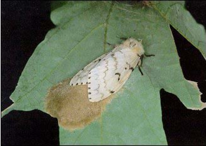
Figure 10 - Female gypsy moth laying eggs.