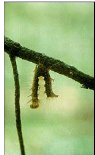
Figure 13 - Larvae infected by the nucleopolyhedrosis virus (NPV) hanging in an inverted "V" position.

Weather affects the survival and development of gypsy moth life stages regardless of population density. For example, temperatures of -20^{\circ}\text{F} . ( -29^{\circ}\text{C} .) lasting from 48 to