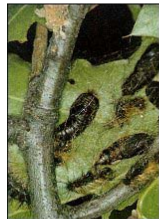
Figure 8 - Gypsy moth pupa.

The larvae reach maturity between mid-June and early July. They enter the pupal stage (fig. 8). This is the stage during which larvae change into adults or moths. Pupation lasts from 7 to 14 days. When population numbers are sparse, pupation can take place under flaps of bark, in crevices, under branches, on the ground, and in other places where larvae rested. During periods when population numbers are dense, pupation is not restricted to locations where larvae rested. Pupation will take place in sheltered and non-sheltered locations, even exposed on the trunks of trees or on foliage of nonhost trees.