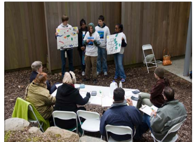
Students at the Oral Presentation station.

All high schools in Nassau and Suffolk Counties are eligible to participate by registering one or two, 5-member teams. All students from the two top scoring teams (one from Nassau & one from Suffolk) receive scholarships, prizes, paid registration, transportation, meals, and lodging to compete in the New York State Envirothon in May. All participating students and their teachers receive an event memento and recognition for their participation.