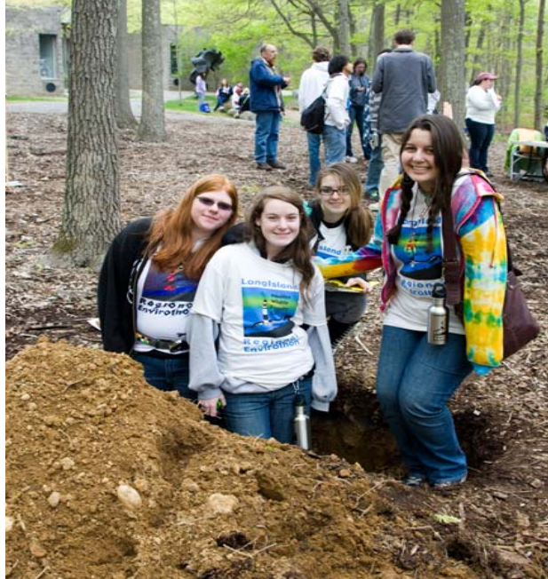
Students in the soil pit at the 2010 L.I. Envirothon held at the Usdan Center for the Creative & Performing Arts.

Thank you to our generous sponsors: Canon U.S.A., Inc., New York Power Authority, Suffolk County Water Authority, Whole Foods Market, the National Grid, Covanta, the Usdan Center for the Creative & Performing Arts, and Nassau County Parks who have provided the funding and/or resources to make this event possible.