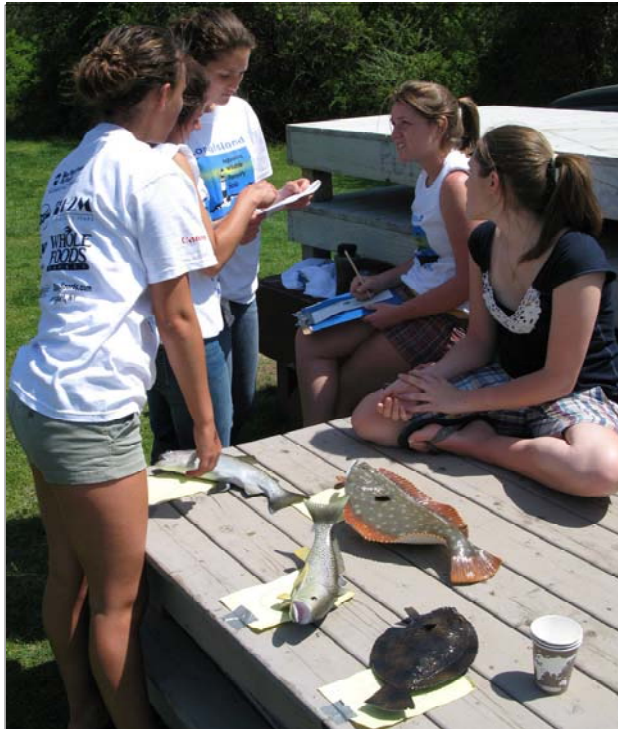
Students answer hands-on questions at the Aquatics Station during the 2009 L.I. Envirothon held at the Old Bethpage Village Restoration in Nassau County.

A “Stationmaster” manages each of the subject areas. These dedicated professionals oversee all aspects for their area of expertise. They approve the learning objectives, reference lists and study guides that are recommended by the New York State Envirothon Committee. In addition, they are responsible for developing the exams and supervising their “Station” during the competition.