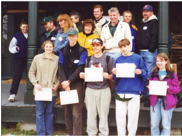
The first L.I. Envirothon held at Connetquot State Park in Oakdale in 1999.